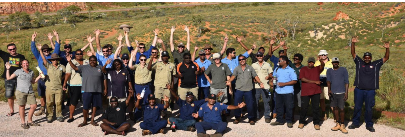
Kimberley Rangers during the Kimberley Bilby Workshop

Over the past 13 years the KNP has grown to employ a team of seven ecologists and environmental scientists, collaborating with Aboriginal and community groups across the region to protect, manage and document ecologically and culturally important species and ecosystems. Project activities include weed, fire and feral animal management; seed collection and propagation; revegetation; targeted and general biodiversity surveys; documentation of traditional ecological knowledge; designing, funding and managing projects; Conservation Action Planning; and regional networking. We have funded these projects from over 60 grants and consultancy contracts from state and federal governments, philanthropists, universities and government departments.